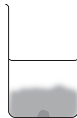
after two days